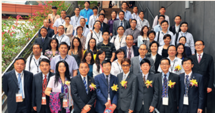
Academics from Mainland China and Hong Kong at the Fifth National Conference on Comparative Management 參與「第五屆全國比較管理研討會」的中港兩地學者

conference aims to gather management experts from China and other countries and regions to present their papers and share insights on the theme of comparative management.