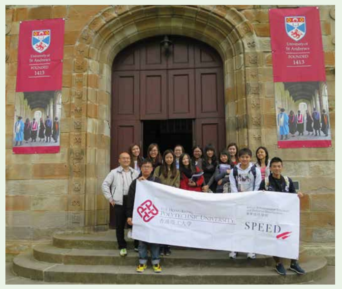
Every summer, 10 students from SPEED Accountancy programme are given the opportunities to join a short course organised by University of St Andrews, Scotland. University of St Andrews is a world-renowned teaching and research centre which has achieved arkable results in business and accounting research

工商業副學士(會計)畢業生升學表現理想,2017年升學率達 91.4%。除了本港八大政府資助學士學位課程外,HKCC畢業生亦 可選擇SPEED提供的升學途徑。