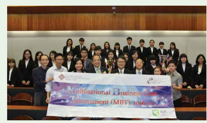
The Multinational Business Case Tournament offers students the opportunity to put their knowledge into practice, and at the same time horn their communication and presentation skills 跨國商業個案比賽讓HKCC同學將知識付諸實踐,同時訓練溝通和演講技巧。

HKCC及SPEED提供的會計學課程均獲多個會計專業團體認可, 包括特許公認會計師公會(ACCA)及英國特許管理會計師公會 (CIMA)等,而會計學(榮譽)工商管理學十學位課程同時獲香港 會計師公會(HKICPA)認可。畢業生可獲豁免部分專業試科目, 更快達成從事專業會計師的理想。