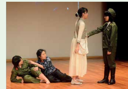
Students performed their own wonderful drama in the competition.

此項SCOLAR資助的計劃，結合普通話學習及戲劇培訓，旨在提升中學生的普通話水平。計劃安排24所本地中學逾240名學生參與各種有趣的活動，包括培訓工作坊、研討會，以及香港演藝學院、鳳凰衛視、香港電影資料館和香港電視台的導賞活動。參加同學於2018年5月進行普通話戲劇匯演比賽，同年10月及11月將舉行成果展覽及分享會暨頒獎典禮。