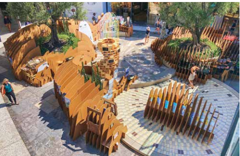
“Island_Peninsula” architecture exhibition 「島與半島」建築展覽

社會科學、人文及設計學部副主任 張海活先生 為香港建築師學會主辦、香港特區政府「創意香港」贊助的建築展覽「島與半島」擔任聯合總策展人。是項活動於2019年9月及10月在美國洛杉磯舉行，包括展覽及論壇兩部分。前者比較了香港和洛杉磯兩地截然不同的城市結構，並剖析獨特的香港式建築的四大核心價值：魅、效、序、變。