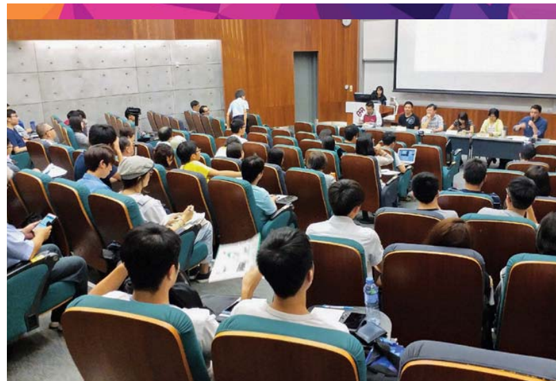
The “Policy Address Forum” enhanced students’ understanding of government policies. 「施政報告論壇」加強同學對政府政策的了解。

HKCC於2017年10月13日舉辦「施政報告論壇」，嘉賓就政府的房屋、青年、社會福利及財政政策發表意見。該論壇獲多個本地民間組織支持，連同HKCC同學在內，共有約100名參加者出席。