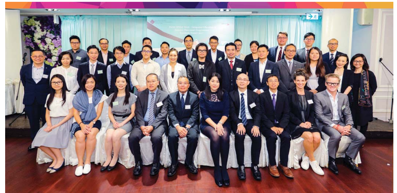
On 20 October 2017, SPEED hosted a gratitude dinner to express its appreciation to the enterprises joining "PolyU SPEED WIE & Summer Placement Programmes 2017". SPEED於2017年10月20日舉行感謝宴，答謝參與「PolyU SPEED 校企協作教育及暑期實習計劃2017」的企業。

A total of 47 enterprises had pledged their support for the "PolyU SPEED WIE & Summer Placement Programmes 2017", providing sponsorship of around HK$1.7 million for the School. About 180 SPEED students benefited from the scholarships and internship opportunities offered by the enterprises.