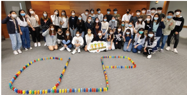
Caring Leaders endeavour to build a caring campus. 關愛大使致力營造關愛校園。

關愛領袖訓練計劃招募了 40 名學生成為關愛大使，在校園推廣和實踐包容、多元和接納的觀念。例如，這計劃為關愛大使提供相關知識及技巧的培訓，使他們能夠協助有特殊學習需要的學生適應校園生活。