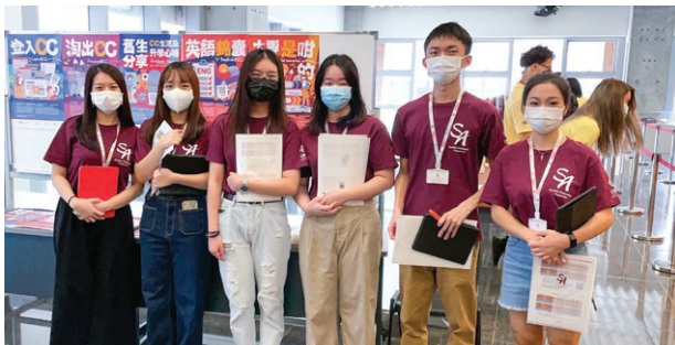
Student Ambassadors assist in orientation activities. 學生大使為迎新活動提供協助。

六十四名學生接受了上年度完成計劃的資深學生大使所提供的訓練之後，在學院眾多活動中擔當不同的角色，包括擔任司儀、剪輯影片及接待賓客。