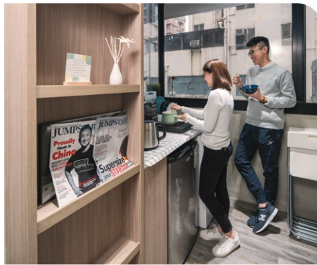
The hostel allows students to enjoy their college life in a co-living environment. 宿舍可讓學生在共居環境下享受大專生活。