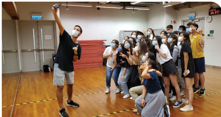
Let's Dance Salsa

全球勝任力培訓計劃旨在培養學生的世界觀及跨文化觀。藉著參加一系列的文化活動，例如「一起跳莎莎舞」及「全球視野對話工作坊」，30名學生學會理解不同文化背景人士的文化價值及信念，從而增強了自己的跨文化溝通能力。