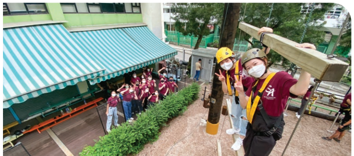
Training camp for student ambassadors 學生大使訓練營