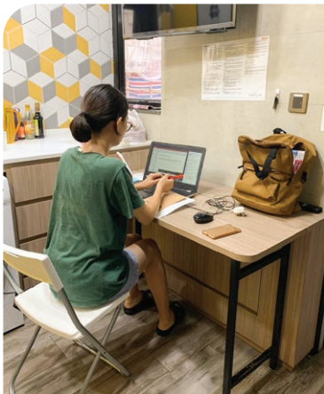
A student is attending an online class in the hostel. 學生正於宿舍上網課。

2022 年 2 月新冠個案急升期間，學院勸喻宿生暫時遷出，以減少面對面接觸，而有實際居住需要的宿生則可留下，並獲派發快速測試包，亦有宿舍導師駐守，提供協助。