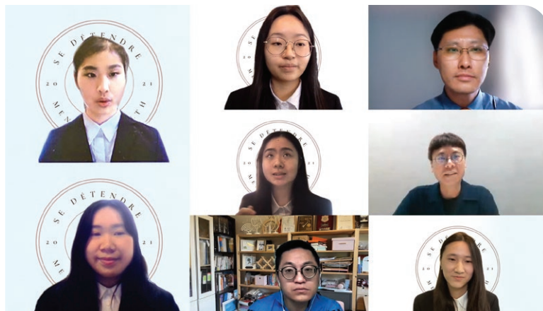
Forty-four student teams from HKCC and SPEED compete in YES. 四十四支 HKCC 及 SPEED 學生隊伍競逐 YES 獎項。

HKCC 及 SPEED 同學聯手組成的 ParkX 奪得冠軍；來自 HKCC 的 Se Détendre 和 BowlEat 分別贏得亞軍及季軍。