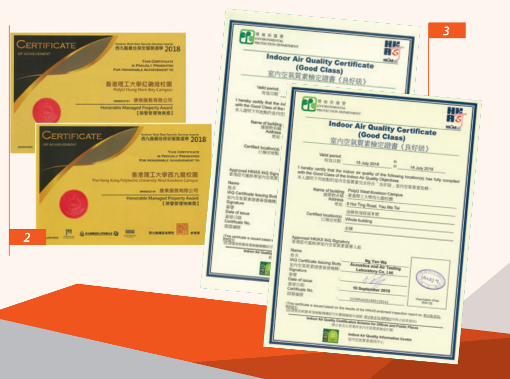
> The HHB Campus and the WK Campus were presented with the "Good Class" IAQ certificates in 2018. 紅磡灣及西九龍校園於2018年獲得「良好級別」室內空氣 質素證書。

在2019年5月舉辦的西九龍最佳保安服務選舉頒獎 管理物業獎」,而譚文傑先生(左)及呂志賢先生 (右二)則獲頒「最佳保安員獎」,出席典禮的校園 設施管理辦事處李惠芳女士 (左四)及何國偉先生 (右三)分享校園和員工獲獎的喜悦。