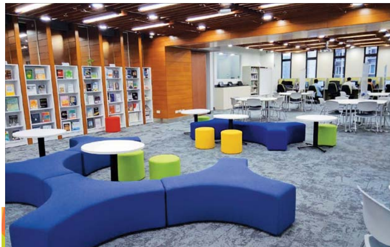
Multi-purpose learning area in the PolyU HHB Library 理大紅磡灣校園圖書館的多用途學習空間