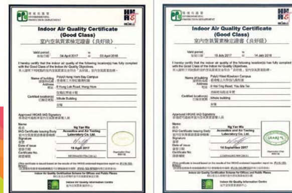
The HHB and WK Campuses were presented with the IAQ certificates. 紅磡灣及西九龍校園獲得室內空氣質素證書。

除了完善的校園設施外，CPCE亦致力為同學及教職員提供良好的室內空氣質素。於香港特區政府的自願室內空氣質素檢定計劃中，紅磡灣及西九龍校園繼續符合辦公室及公眾場所的室內空氣質素檢定標準，於2017年再度獲得「良好」評級。