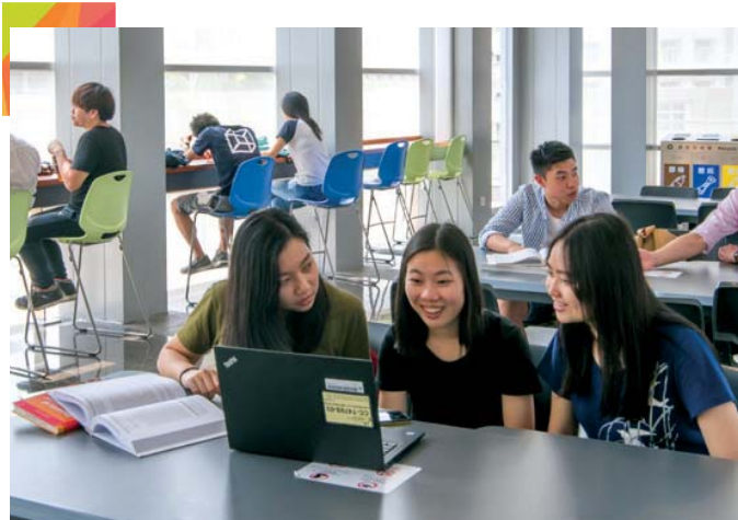
Students are provided with loan service of tablet or notebook computers. 學生可享用手提或平板電腦借用服務。

During the year, the CPCE Libraries also organised "The Electronic Resources Week" to publicise the benefits of using e-books, e-journals and e-databases among staff and students. The growing adoption of electronic resources would facilitate the continual expansion of library collections without any physical space constraints.