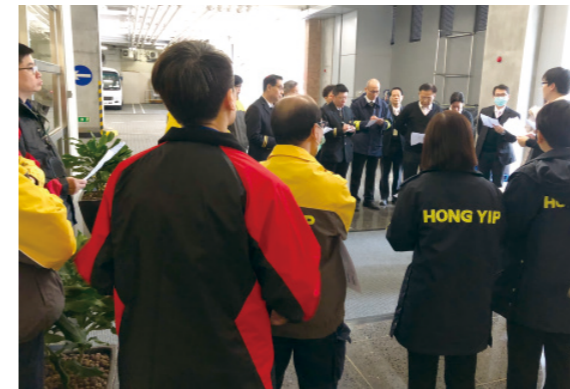
The campuses are managed by a professional property management team. 校園管理由一支專業的物業管理團隊負責。

The PolyU HHB and WK Campuses were awarded the Honorable Managed Property in the Kowloon West Best Security Services Awards 2020 held by the Kowloon West Regional Crime Prevention Office, the Security and Guarding Services Industry Authority, and The Hong Kong Association of Property Management Companies.