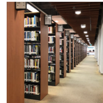
Replacing downlights to improve lighting 更換筒燈，改善照明