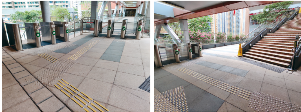
A new tactile guide path is installed on the PolyU HHB Campus. 理大紅磡灣校園鋪設了新的觸覺引路帶。

A tactile guide path – leading from the turnstiles at the footbridge of the PolyU HHB Campus to the barrier-free entrance on UG/F – was installed in January 2021.