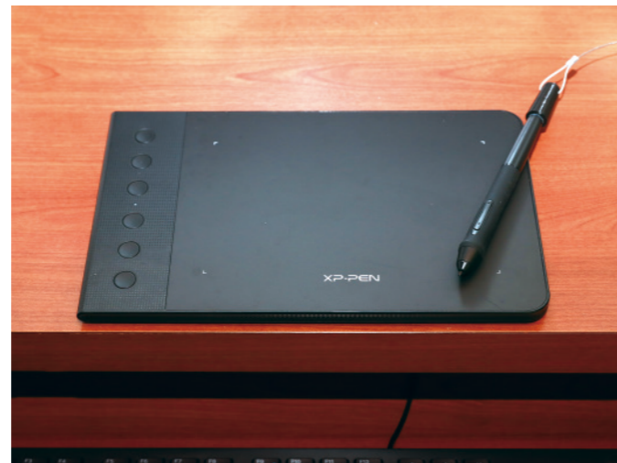
Writing tablet 手寫版