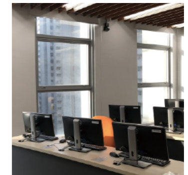
Putting up solar control window film 玻璃窗加上太陽隔熱膜