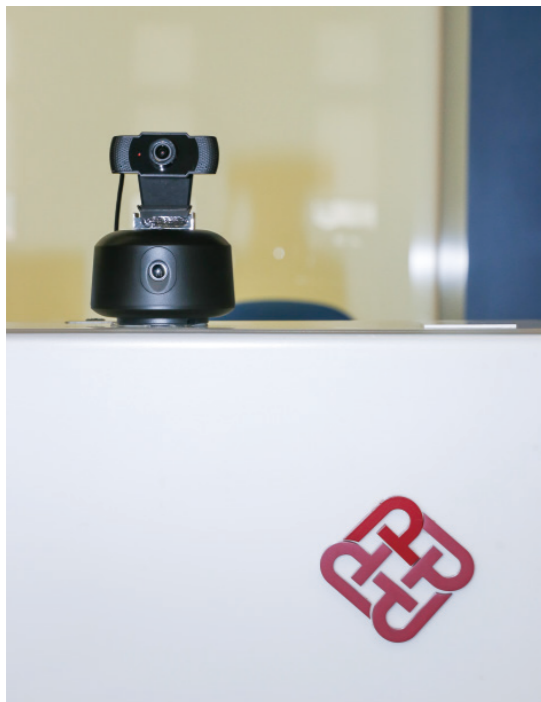
Auto-tracking 360 camera 自動人物追蹤 360 攝影機

為應付混合模式授課的需要，CPCE 資訊科技處於教學場地完成多項改善工程，包括 (1) 安裝手寫版以作網上白板之用；(2) 支援 MS Teams/Zoom 的實物投影機；(3) 提升課室影音系統的收音功能，將課室的聲音傳至網上課堂；及 (4) 開發具備自動人物追蹤功能的 360 攝影機，跟隨講師在講台範圍的移動。