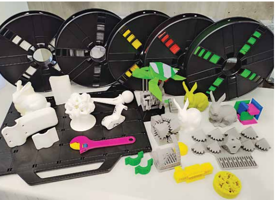
3D product samples 三維打印產品樣本