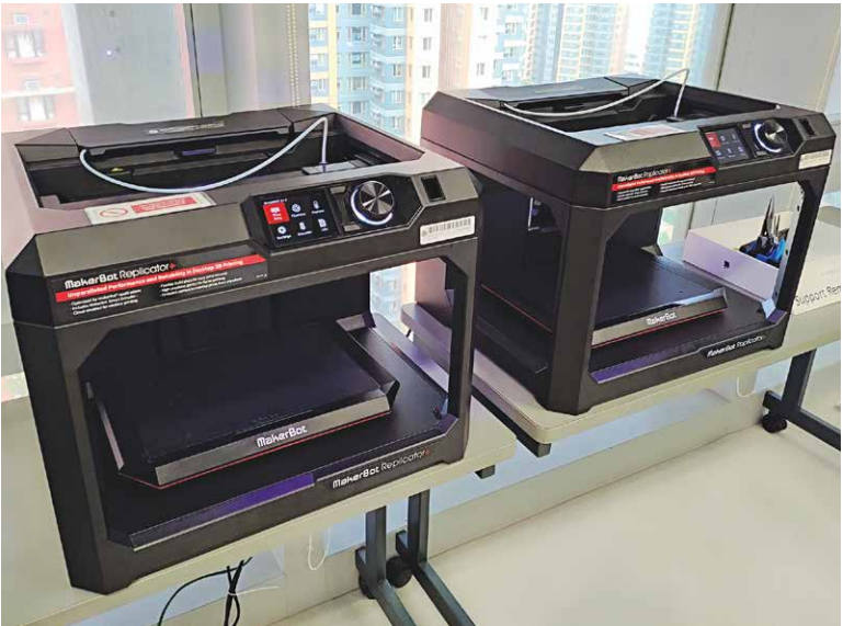
Makerbot replicator+ 3D printer Makerbot replicator+三維打印機

ITU亦於西九龍校園的學生電腦中心設立數碼影像工作室，提供色鍵背景、三台高質攝錄機、無線麥克風、視頻混合器，以及燈光控制系統；這些設施能夠支援聲音及影像錄製、相片拍攝、製作用於混合學習的課堂素材，以及演講排練等。