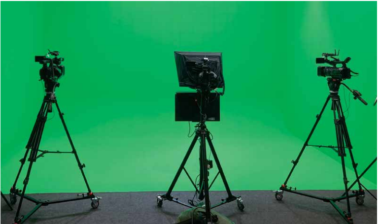
Chroma key background 色鍵背景

An e-Making Studio was also set up by the ITU in the student computer centre of the WK Campus. This studio is equipped with a Chroma key background, three high quality camcorders, wireless microphones, a vision mixer, and a lighting control system; these facilities support audio and video recording, photo shooting, creation of class materials for blended learning, and speech rehearsal, etc.